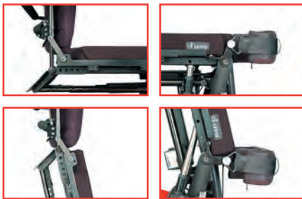
Back and knee adjustment to reduce shear

anywhere in between. In any position you can engage the world with power mobility – move, turn, reverse – all while in any of the multiple and customized seating positions that you choose for your chair. The LEVO combi easily maneuvers within your home, your work, indoors, outdoors, all while ensuring stability, safety, multiple seating and standing positions to enhance and extend quality of life.